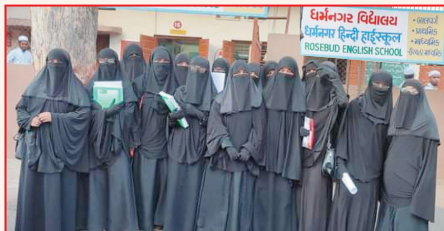
Jamiat open school students after taking 10 th exams in centers

Within a period of one year, its acceptance and popularity has augmented beyond the expectation. Now as many madarsas from the all across the country are willing to join it. Even the largest Islamic university Darul Uloom Deoband passed resolution to urge its affiliated madrasa to join the bandwagon. It is a very positive sign. Jamiat has opened a Jamiat National Open School with our mission to recreate trained and support Madrasa students enabling them