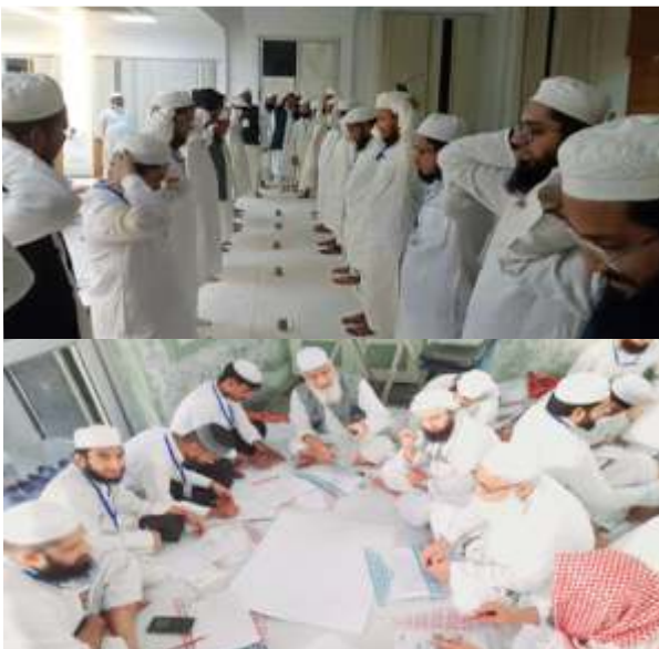
Part 4: Enhancing Skills of Jamiat Workers

This comprehensive approach ensures a structured, immersive, and rewarding learning environment, promoting holistic development and engagement for all participants.