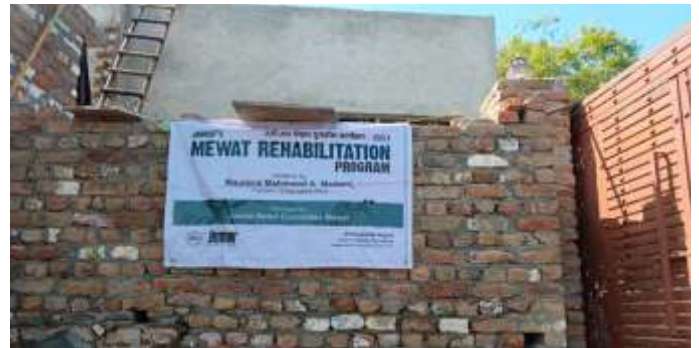
Pic: A house built by Jamiat for the victims