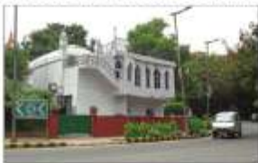
NDMC had sought public response to the proposed removal of the mosque.

New Delhi: Several architects have expressed the demolition of the mosque as the Sunehri Bagh masjid and made an appeal against its removal in the interest of protecting the country's cultural heritage.