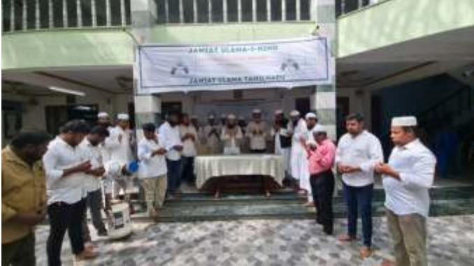
Pic: Jamiat Ulama Tamil Nadu volunteers making dua during relief work