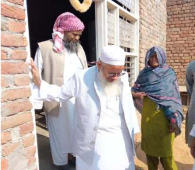
Pic: Jamiat President handing over key and inspecting.